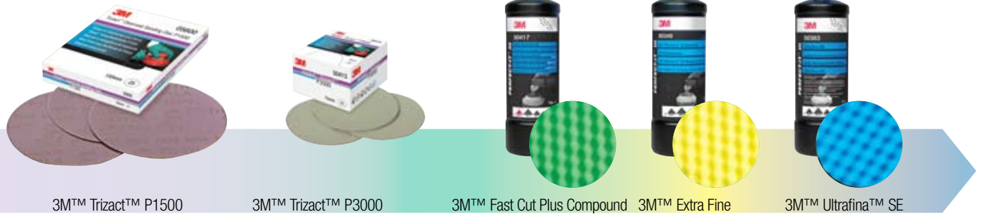
3M™ Trizact™ P1500